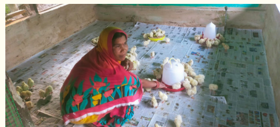
Table 3 : Poultry support provided to members in Q4

All backyard poultry farmers have earned additional income from sale of eggs from their birds. The details of the eggs from each enterprise is mentioned in table 4.